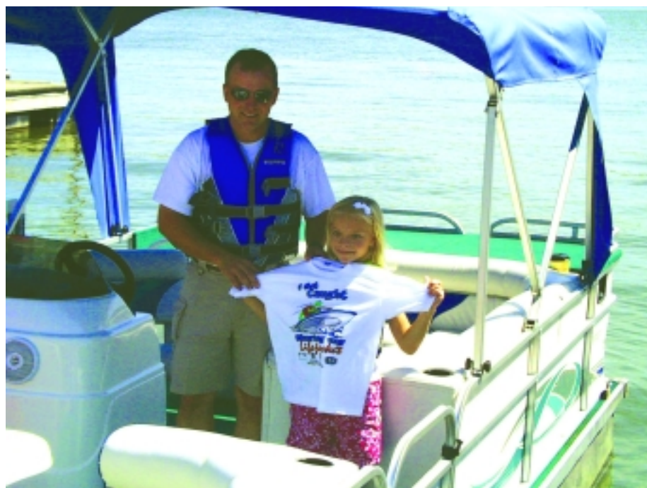
This young boater proudly displays her new T-shirt. A Missouri State Water Patrol officer gave her the shirt as a reward for wearing her life jacket while boating.

It is hard to explain to a child how important it is for them to wear their life jacket, so why not reward them?