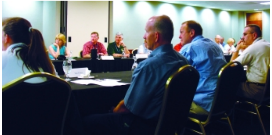
The National Association of State Boating Law Administrators held its first Boating Law Administrators Workshop. This meeting provided the state boating authorities with an open forum for discussing various issues affecting recreational boating safety, education and enforcement.

The polling proved to be a popular feature of the workshop. Participants enjoyed the chance to be involved in the process by using handheld response keypads to answer various questions.