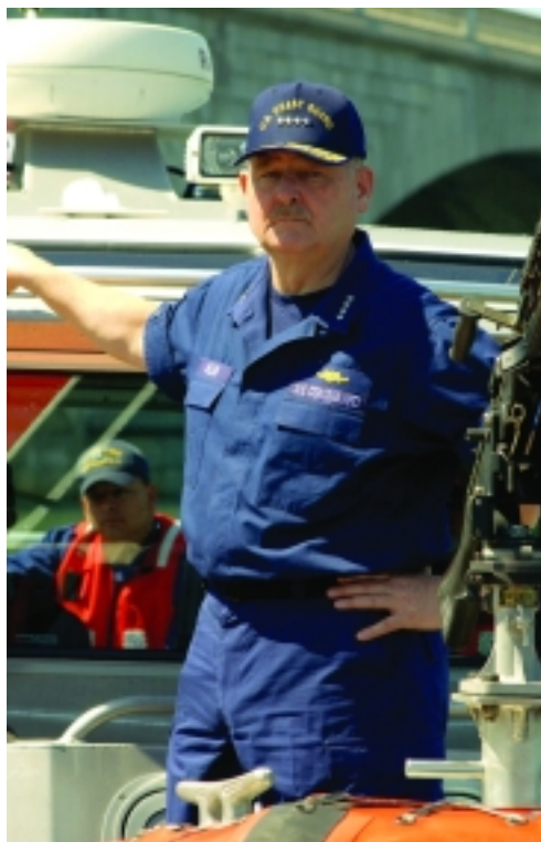
Shortly after being appointed as Commandant, Admiral Allen began developing a maritime security strategy that will guide the U.S. Coast Guard's decision-making, rulemaking, technological requirements and requests for legislation. The strategy will focus on the agency's core mission areas of security, safety and stewardship of waterways. Allen hopes to create a "strategic trident" that will govern shore-based operations, off-shore capabilities and a new deployable operations group.