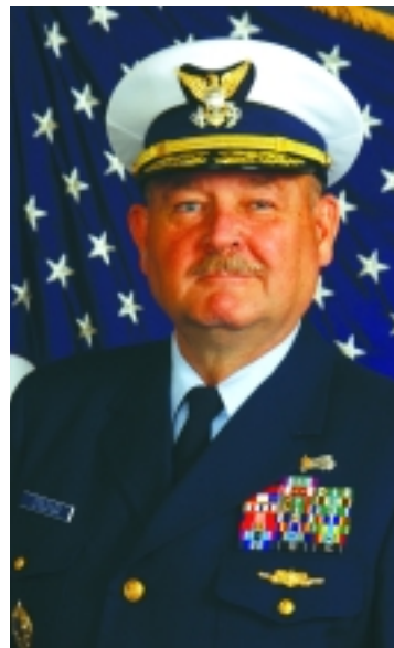
Admiral Thad Allen became the Commandant of the U.S. Coast Guard on May 25, 2006. Allen became a well known figure following his widely-praised performance directing the federal government's recovery efforts following Hurricanes Katrina and Rita in the Gulf Coast region from September 2005 to January 2006.

President Bush said that Vice Admiral Allen follows a distinguished commandant in Admiral Thomas H. Collins, who led the Coast Guard during one of the more challenging periods in its history. "[Admiral Collins] helped to ensure a seamless transition into the department and introduced emerging technologies and innovative programs that have enhanced overall mission performance," added President Bush.