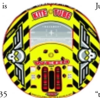
The Wego Kite Tube was recalled in cooperation with the U.S. Consumer Products Safety Commission.